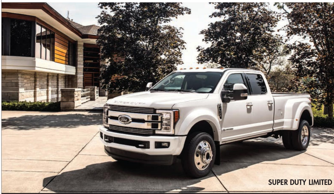
SUPER DUTY LIMITED

Not everyone who needs a truck will use it to haul rocks, dirt, hay and utility trailers. Some will haul gold-plated yachts and diamond-encrusted Rolls Royces (we jest, of course). For these customers — ahem , clients — Ford presents its Super Duty Limited Series and invites the well-heeled to shell out to $94,455 for